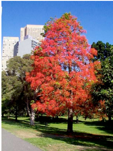
Brachychiton acerifolius in flower